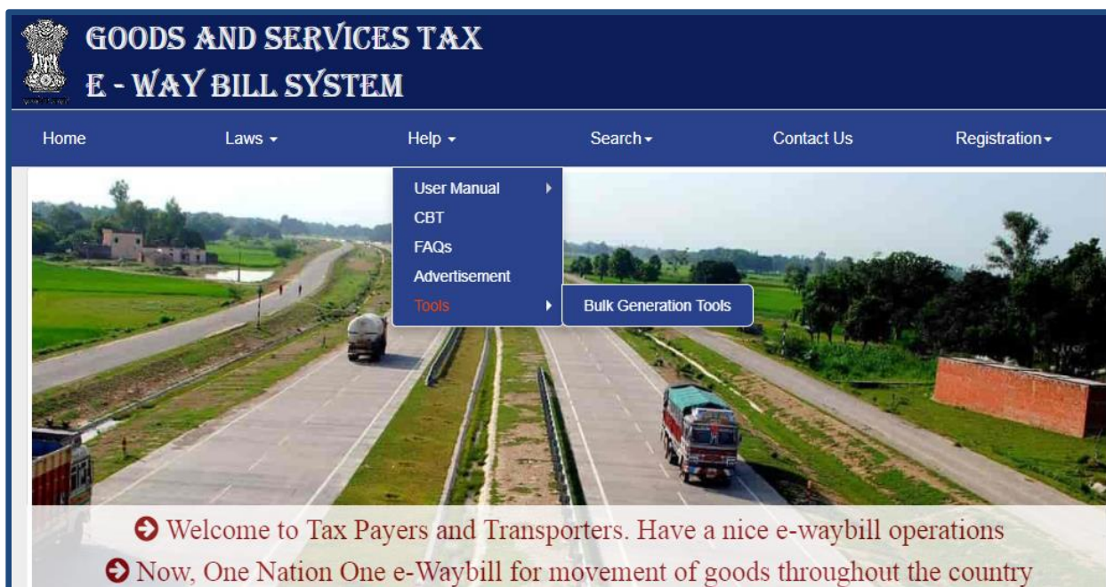
Figure 1: Bulk Generation Tool.

In this process, the taxpayer or transporter opens the EWB portal and downloads the formats provided under 'Bulk Generation Tools'. This tool has been provided on the demand of the tax payers as alternative mechanism. This tool can be downloaded by the tax payer from 'Help-> Tools-> Bulk Generation Tools' option provided in EWB portal as shown below.